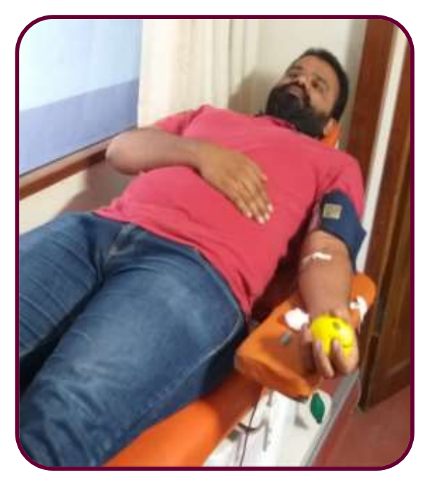
Blood Donation Camp, Thalassemia Sickle Cell Control Programmes