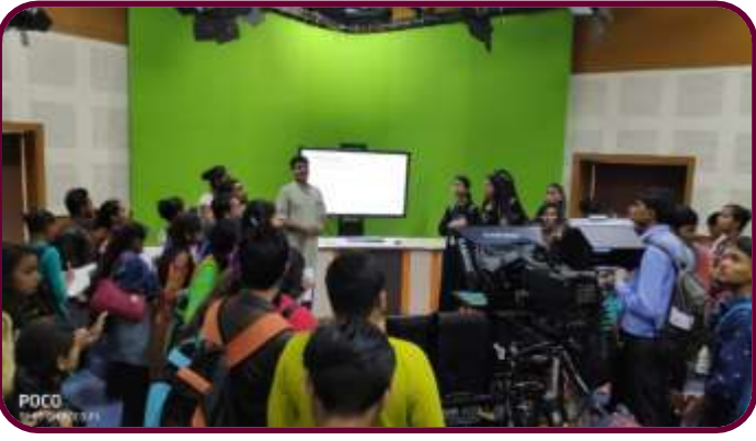
Field Visits BAOU – Ahmedabad GCERT – Gandhinagar DIET – Anand AMUL - Anand